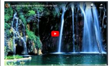
More on Landforms and Bodies of Water