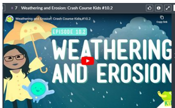
Weathering and Erosion