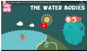
The Water Bodies

Watch this video to learn about the different bodies of water.