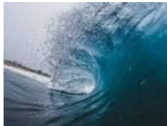
A Hypnotic Journey Through Waves and Water